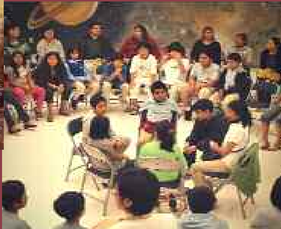
Family-Community Council at Wilshire Park Elementary.

The Ojai Foundation 9739 Ojai-Santa Paula Road Ojai, CA 93023