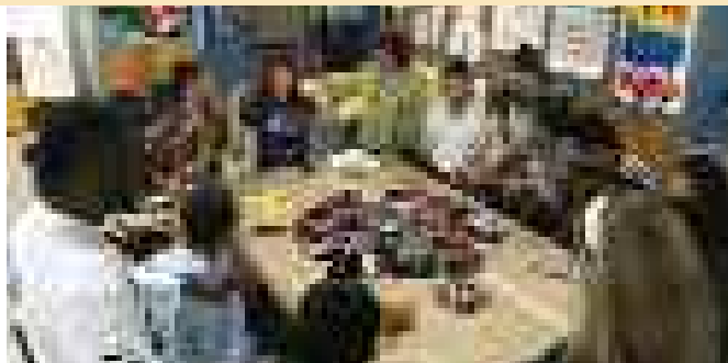
Council at the Marilton School, LAUSD school for deaf and hard of hearing students.